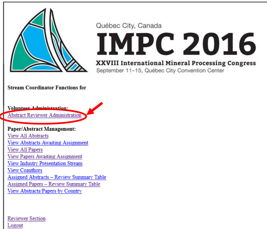
Figure 1 – Screen that loads when you click Administrative Section

3. To add an individual to the reviewer roster, click on Abstract Reviewer Administration (Figure 1).